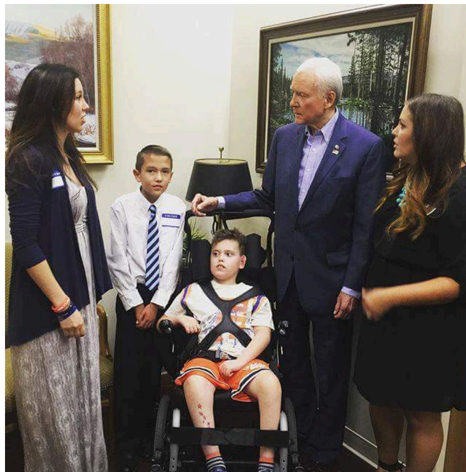
Sen. Orrin Hatch (R-UT)