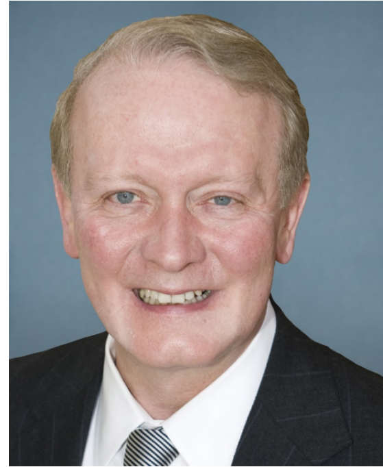
Rep. Leonard Lance (R-NJ)