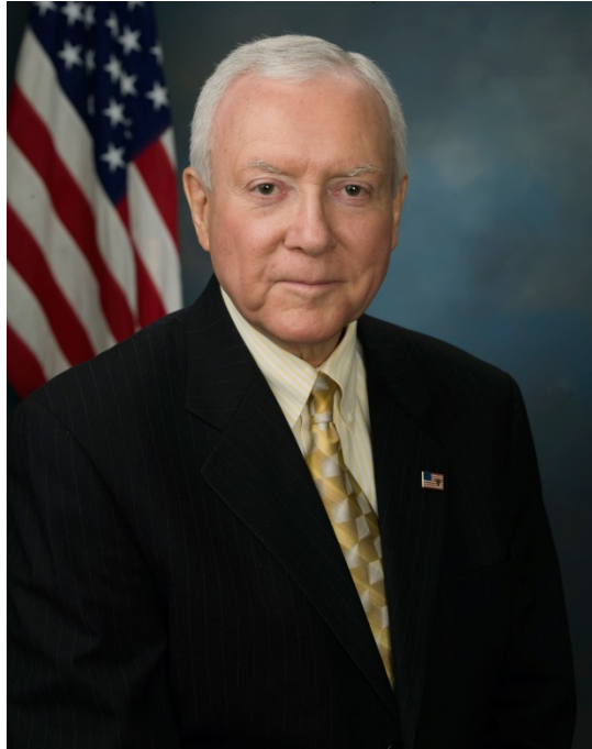
Sen. Orrin Hatch (R-UT)