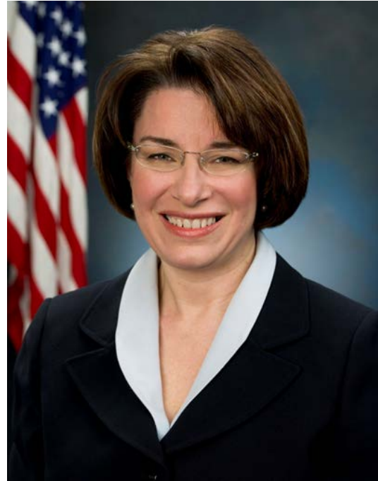
Sen. Amy Klobuchar (D-MN)